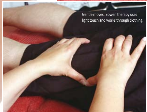
Gentle moves: Bowen therapy uses light touch and works through clothing.